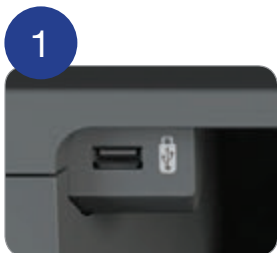
USB direct print*